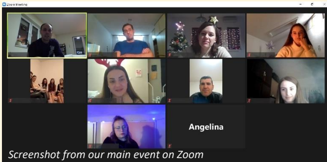
Screenshot from our main event on Zoom

The best part of the celebration was the main event, which started at 10:30 p.m. The theme for the evening was „Бог Делува“ or “God is Working.” We started our time together by sharing ways we have seen God working or acting in our lives this past year. Then we played charades with all the clues being a different kind of work or worker. The bank teller counting money and the gas station attendant pumping gas were among the more memorable performances! After the game, we sang some songs together. We were really blessed to have the girls from the Murtino church lead us.