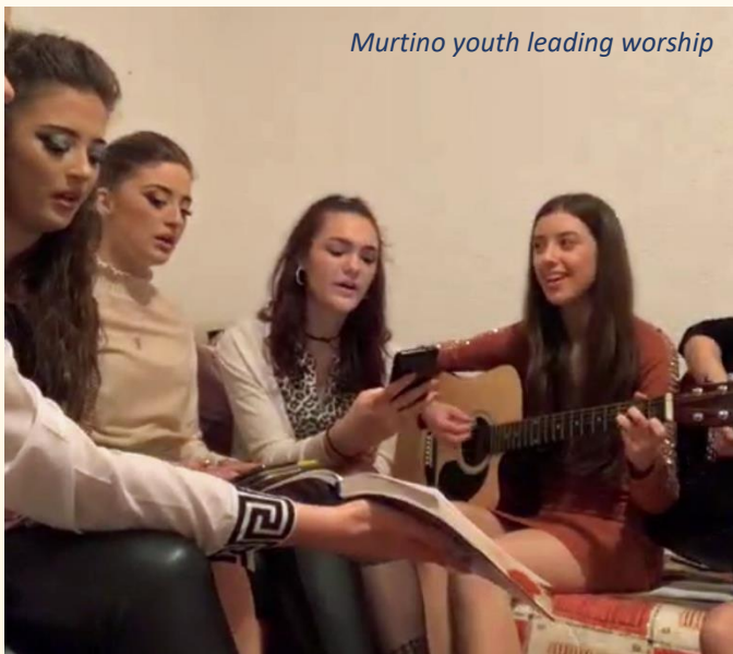
Murtino youth leading worship

The best part of the celebration was the main event, which started at 10:30 p.m. The theme for the evening was „Бог Делува“ or “God is Working.” We started our time together by sharing ways we have seen God working or acting in our lives this past year. Then we played charades with all the clues being a different kind of work or worker. The bank teller counting money and the gas station attendant pumping gas were among the more memorable performances! After the game, we sang some songs together. We were really blessed to have the girls from the Murtino church lead us.