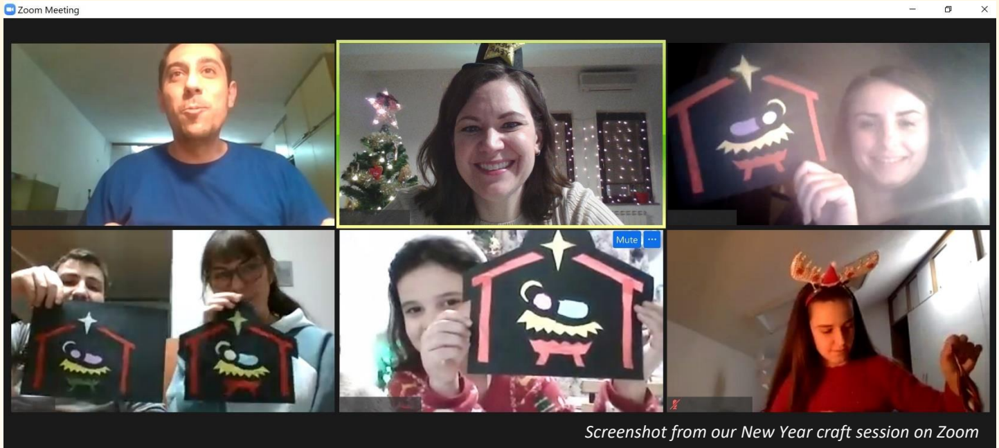
Screenshot from our New Year craft session on Zoom

“Let our New Year’s resolution be this: we will be there for one another as fellow members of humanity, in the finest sense of the word.” ~Goran Persson