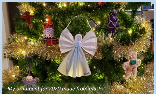
My ornament for 2020 made from masks

Understandably, most people would label 2020 as the year to forget. However, this past year of distancing and pause has given all of us the chance to reflect on our lives, evaluate relationships, and reassess priorities in ways previously unknown. I have been reminded of the fragility of life and spent more time leaning on God in prayer than ever before. I don't know about you, but 2020 was also a year I faced many of my fears. I have grown a lot this year and I am thankful. Sure, 2020 is not a year I'd like to repeat, but the lessons I've learned and new perspectives I've gained are things I will forever treasure.